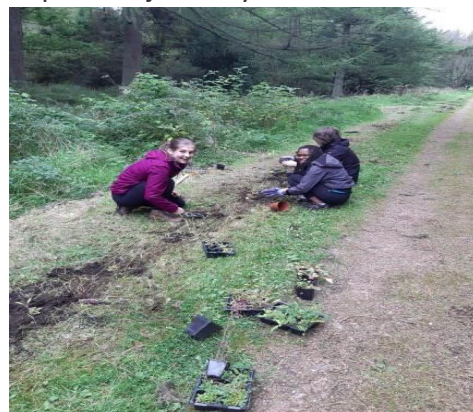
The group sowing wildflower seed mix at Morton Lochs.