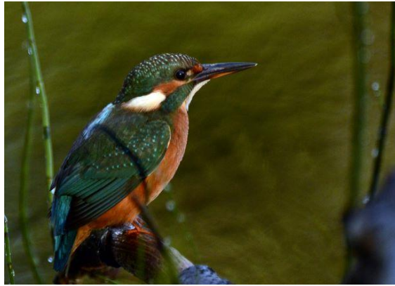
Left: young otter Right: the kingfisher.