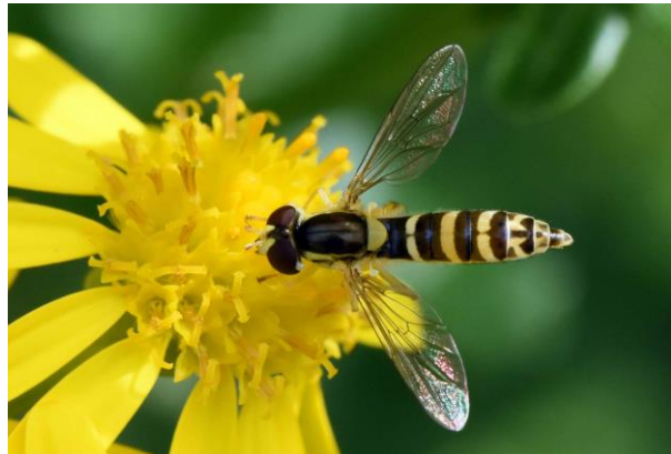
Left: male crossbill, Right: Sphaerophoria scripta hoverfly,