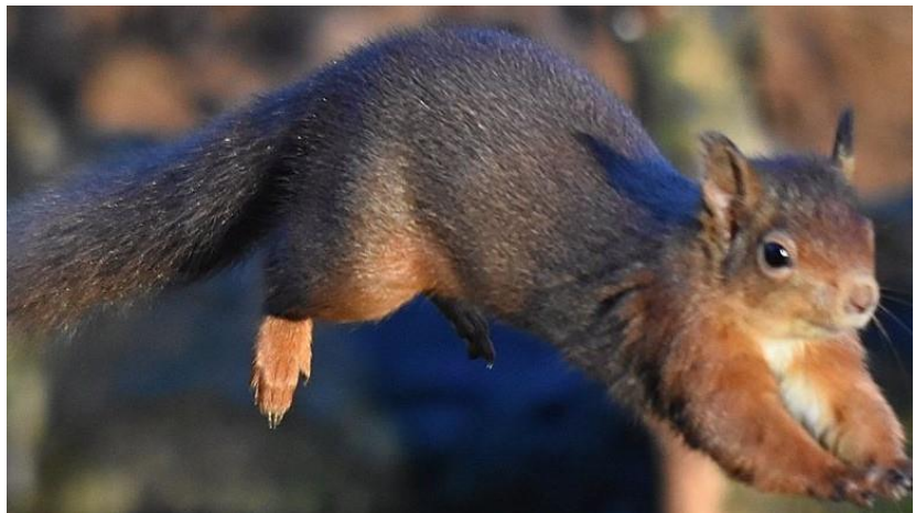
Red Squirrel leaping by Steve Buckland.

The hide has become very popular and so special to a lot of visitors we have spoken to some people who travel regularly for example from Brechin, Peterhead and Glasgow just to see the squirrels and birds that frequent the site. In addition to the squirrels, you can observe great spotted woodpeckers, tree creepers, coal tits, blue tits, long-tailed tits, wrens, chaffinches, sparrowhawk, buzzard and, if you are really lucky, spot badgers snuffling around at the base of the trees picking at the dropped nuts.