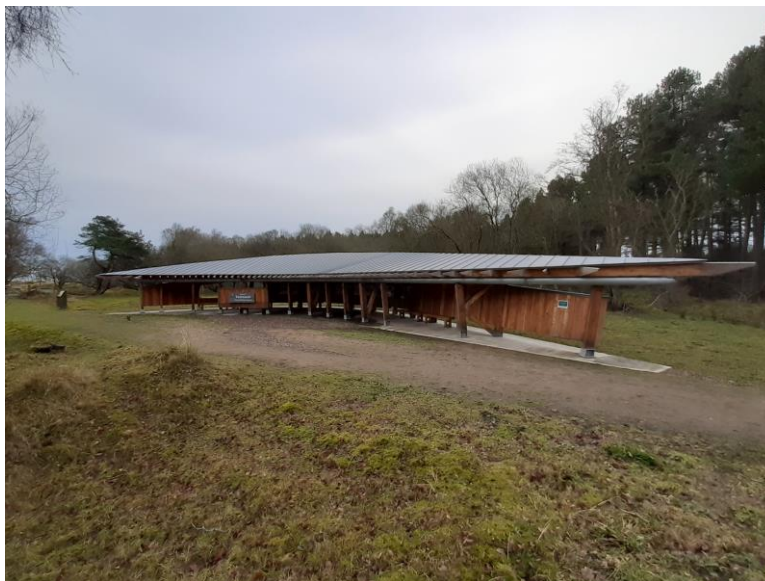
The Education Pavilion on Tentsmuir Point.